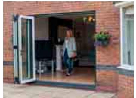
The Imagine Bi-Fold Door makes an attractive alternative to a traditional sliding patio door; completely opening your home up to the garden or patio.